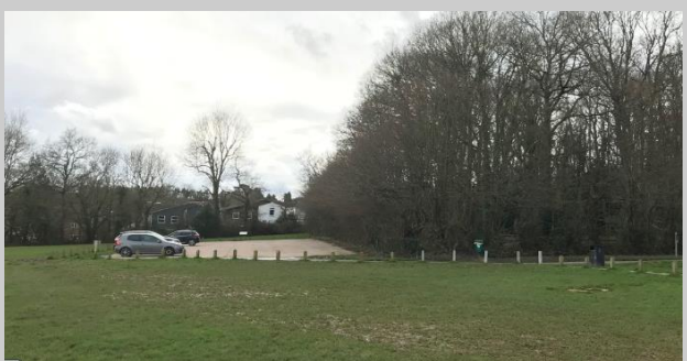
Figure 3 – Lower East Court play area car park