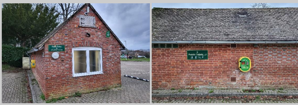
Figure 1 – East Court AED