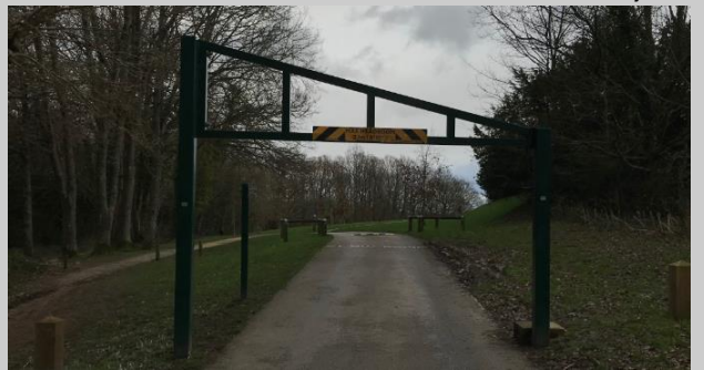
Figure 2 – Vehicle height restriction at entrance road to Lower East Court play area car park

Note: Maximum vehicle headroom is 2.1m, 6' 10"